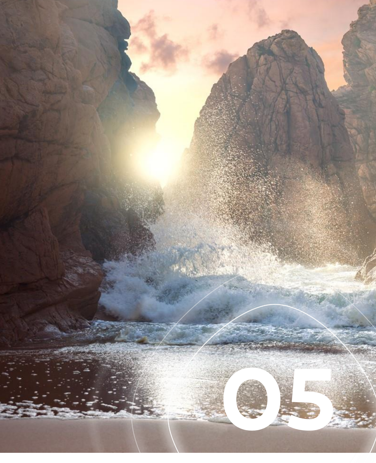
INTERIM CONSOLIDATED FINANCIAL STATEMENTS